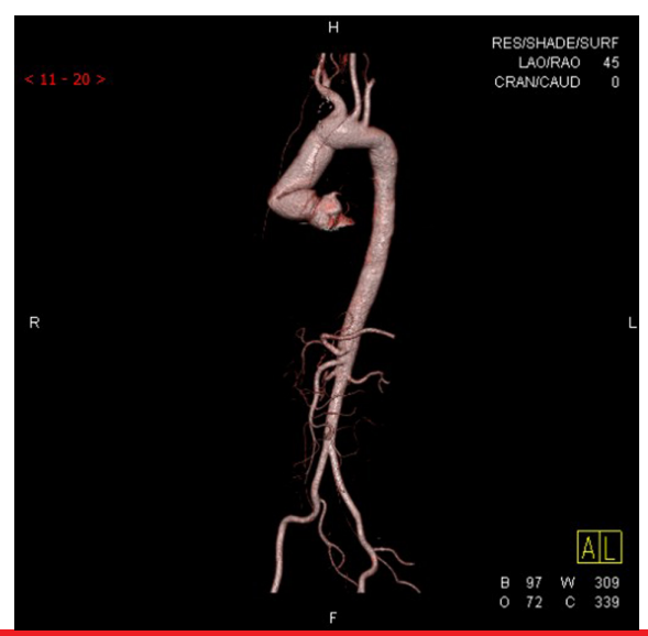
Figure 2. The 3D reconstruction by CT revealed the severely kinked graft. CT, computed tomography.