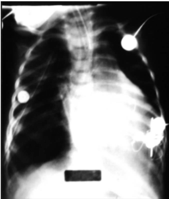
Figure 4. Postoperative chest X-ray

therapies create potential problems such as the development of serious haemorrhages that are more frequent in children. Our patient was anticoagulated with warfarin. We will decide further the type of therapy according to patient's follow-up.