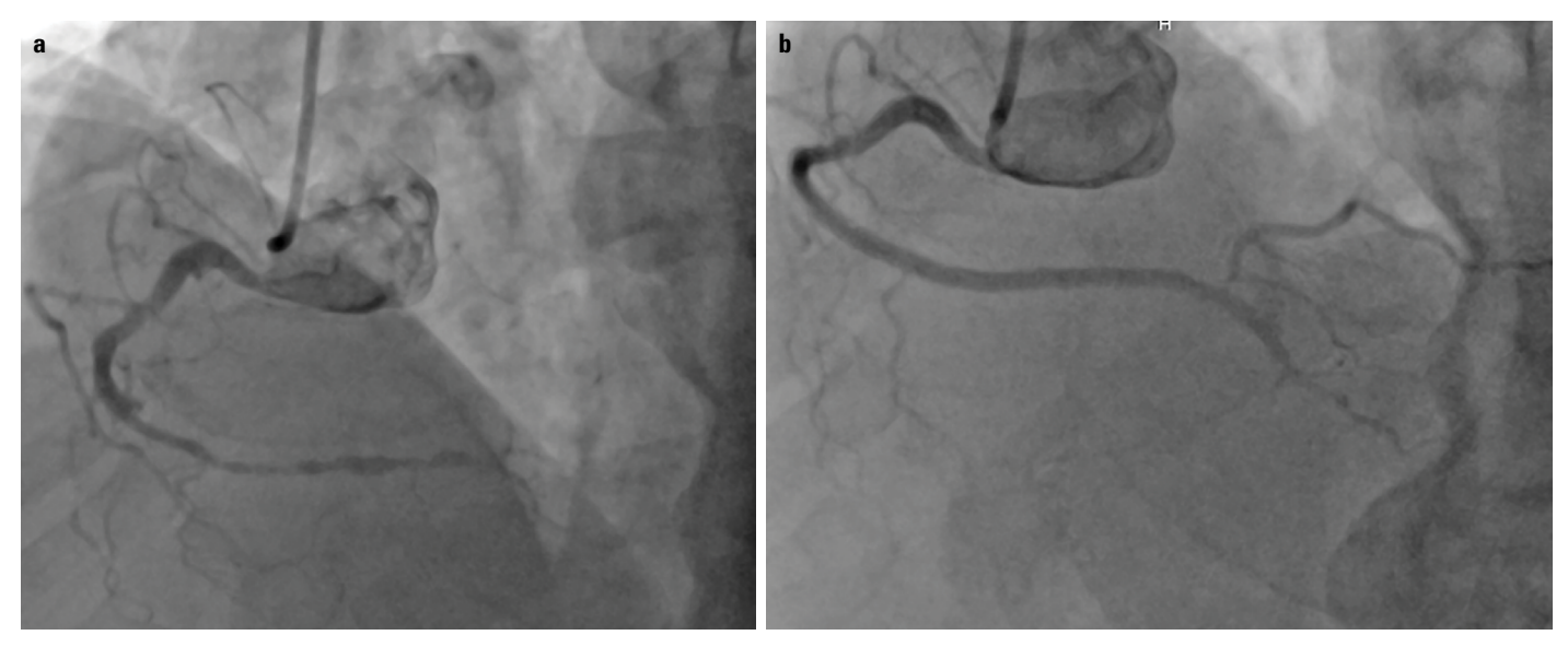
Figure 1. (a) Pre-revascularization right coronary artery. (b) Right coronary artery post revascularization

Guidezilla guide extension catheter system (Boston Scientific) (6). We present this case as an example of a simple but novel solution for preventing this complication.