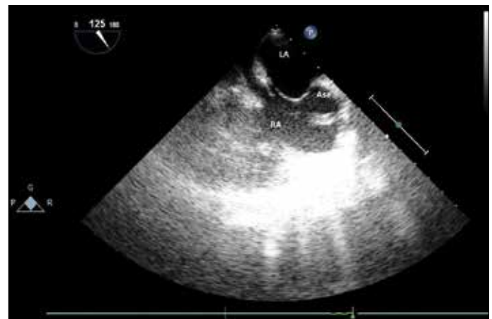
Figure 2. Transesophageal echocardiographic image showing an atrial septal aneurysm and cor triatriatum dexter