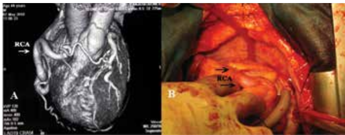
Figure 2. A) Multislice computed tomography angiography view of aneurysmatic right coronary artery originating from the aorta, B) Intraoperative view of the aneurysmatic dilatation of the right coronary artery due to high flow

it was closed primarily by Teflon pledgeted 4/0 polypropylene sutures. Excessive systemic collateral flow was impeding exposure despite a properly placed aortic cross-clamp and a fully arrested and vented heart. Intracoronary shunts (ClearView® Medtronic Inc. Minneapolis, MN, USA) were used to divert flow away from the site of anastomosis. Left internal mammary artery and a saphenous vein graft were anastomosed to LAD and circumflex artery respectively. The patient was discharged on the sixth postoperative day after an uneventful recovery. He is well and free of ischemic symptoms in his second year following the operation.