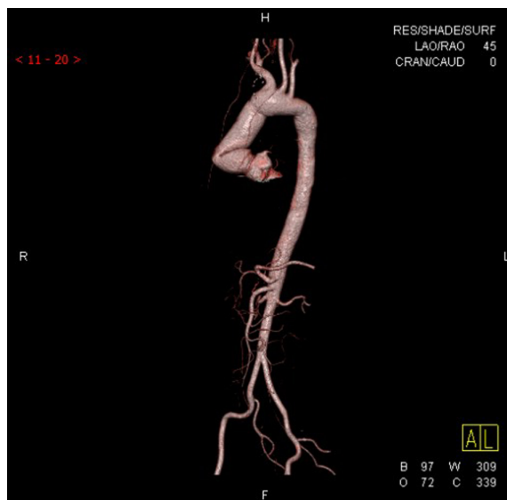
Figure 2. The 3D reconstruction by CT revealed the severely kinked graft. CT, computed tomography.

He Dongsheng ID 1 Li Yifan ID 2 Tang Juan ID 3,4 Wu Zhong ID 2