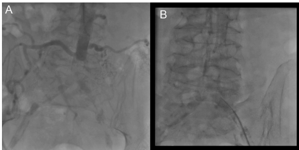
Figure 1. (A) Diagnostic angiography revealing heavily calcified bilateral aortoiliac occlusion extending to femoral arteries. (B) Distal tip of guidewire penetrating to the lesion using 4-Fr catheter and crossing the lesion using electrocautery assistance.

to attempt electrocautery-assisted crossing of the lesion. A 0.014" guidewire Astato XS40 (Asahi Intecc) advanced to the lesion in 4 Fr Judkins right (JR) catheter. The 4F JR catheter was kept to the level of the occlusion to protect the iliac artery distal to the occlusion, distal tip of Astato XS40 guidewire was penetrated to the lesion, and proximal tip of guidewire was connected to a unipolar electrocautery pencil using forceps. After making sure that it was intraluminal using 2 different angiographic angles, electrocautery with cutting mode was applied, guidewire was energized at 50 W for 3 seconds, and crossed the calcified lesion intraluminally (Figures 1b, 2, Video 2) after second attempt. After dilatation with 3.0 × 20 mm coronary balloon, the 4-Fr catheter crossed the lesion and 0.014" guidewire exchanged with a 0.035" guidewire. Aortoiliac lesion was dilated using 6.0 × 60 mm and 7.0 × 80 mm balloons (Figure 3a, Video 3). Bilateral aortoiliac 8 × 59 mm stent graft Advanta V12 (Atrium Europe B.V, Mijdrecht, the Netherlands) was implanted using kissing stent technique. Then 8 × 59 mm stent graft and 8 × 59 mm balloon-expandable stent were implanted to right and left iliac arteries, respectively (Figure 3b, Video 4). Procedure was done without complication. Patient was started on aspirin and clopidogrel.