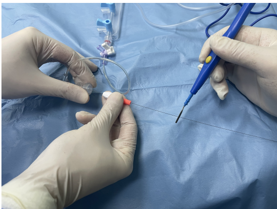
Figure 2. Demonstration of electrocautery setup in the catheter laboratory. Tip of guidewire is connected to a unipolar electrocautery pencil.

to attempt electrocautery-assisted crossing of the lesion. A 0.014" guidewire Astato XS40 (Asahi Intecc) advanced to the lesion in 4 Fr Judkins right (JR) catheter. The 4F JR catheter was kept to the level of the occlusion to protect the iliac artery distal to the occlusion, distal tip of Astato XS40 guidewire was penetrated to the lesion, and proximal tip of guidewire was connected to a unipolar electrocautery pencil using forceps. After making sure that it was intraluminal using 2 different angiographic angles, electrocautery with cutting mode was applied, guidewire was energized at 50 W for 3 seconds, and crossed the calcified lesion intraluminally (Figures 1b, 2, Video 2) after second attempt. After dilatation with 3.0 × 20 mm coronary balloon, the 4-Fr catheter crossed the lesion and 0.014" guidewire exchanged with a 0.035" guidewire. Aortoiliac lesion was dilated using 6.0 × 60 mm and 7.0 × 80 mm balloons (Figure 3a, Video 3). Bilateral aortoiliac 8 × 59 mm stent graft Advanta V12 (Atrium Europe B.V, Mijdrecht, the Netherlands) was implanted using kissing stent technique. Then 8 × 59 mm stent graft and 8 × 59 mm balloon-expandable stent were implanted to right and left iliac arteries, respectively (Figure 3b, Video 4). Procedure was done without complication. Patient was started on aspirin and clopidogrel.