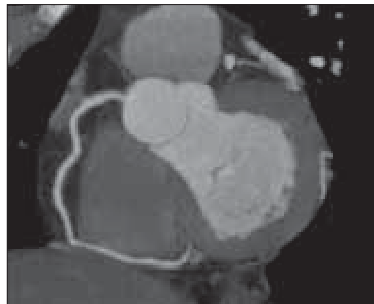
Figure 2. A computed tomography angiography image shows the normal right coronary anatomy without any evident lesion along

As a result, non-invasive approaches such as CT angiography could be preferred instead of invasive coronary angiography if there is not available high suspicion of significant coronary lesion. This approach may substantially remove this suspicion from both clinician and patient.