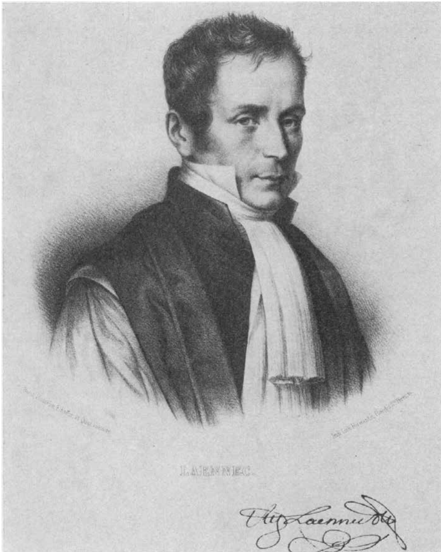
FIG. 2. Portrait of Doctor René Théophile Laennec.

Of the physicians of the Paris school of medicine in the early nineteenth century, in the days of its pre-eminence, René Laennec, the Breton, is best remembered. His invention of the stethoscope in 1816 (the year after Waterloo), his development of the physical examination of the chest, and his correlation of auscultation and pathological anatomy began a method in chest medicine, which, reinforced and not superseded by radiology and thoracotomy, is still ours. Laennec died at his home at Kerlouarnec in Finistère on the 13th August, 1826, only five months after writing this certificate. It is interesting to see the similarity of the signature on the certificate to that reproduced on the portrait of Laennec (Figure 2).