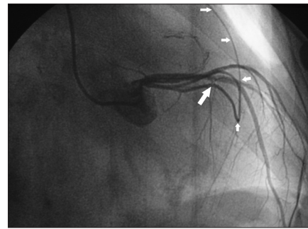
Figure 1. Figure shows sinus node artery (small white arrows) originating from distal circumflex artery (big white arrow)

Address for Correspondence/Yazışma adresi: Dr. Hasan Kocatürk Osman bektaş mah. Sekili sok. Osmanlılar apart. A blok 3/5 25070 Erzurum, Turkey Phone: +90.442.329 00 00 Fax: +90.442.329 04 20 E-mail: haskturk@hotmail.com