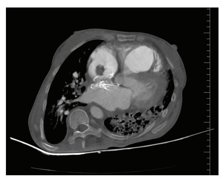
Figure 2. Computed tomography angiography of the thorax demonstrating the ball-like thrombus in the right atrium adjacent to the atrial septal defect closure device

Video 1. Transthoracic echocardiographic apical four-chamber view