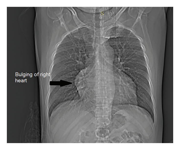
Figure 1. Chest radiography revealed a bulge on the right side of the heart.

Coronary angiography was performed for differential diagnosis; it revealed an aneurysmal sac filling with radiopaque material on the trace of the right coronary artery, indicating communication with the ascending aorta, and distal branches of the right coronary artery filling in the late phase of angiography; however, the left main coronary artery and its branches appeared normal.