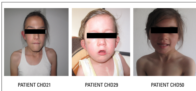
Figure 1. Facial characteristics of patients CHD 21, CHD 29 and CHD 50 22q11 deletion. For these three patients, the results of MLPA assay were confirmed using fluorescence in situ hybridization (FISH). In patients CHD21 and CHD29, 22q11.2 deletions were confirmed using the QBiogene PDEL 5141 DiGeorge DGSCR2 (CLTD) probe; however, in patient CHD50, 22q11.2 deletion was not identified using the Vysis 32-190012 DiGeorge Region N25 probe. The MLPA assay also detected three deletions and two duplications of exon 9 of CTSB . In 8p23.1 chromosomal region, patients CHD42, CHD43, and CHD50 had a deletion of exon 9 of CTSB downstream of GATA4 , and patients CHD21 and CHD29 had a duplication. Deletions and duplications of exon 9 of CTSB were considered polymorphisms (Table 2).