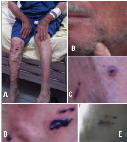
Figure 1. Cutaneous lesions on the upper and lower limbs distal to the ankle and elbow joints in Case 1 (A). Lesion on the left side of the cheek (B). Red discoloration around the vesicles on the focused lesions of the lower extremity (C, D). The largest lesion on the right leg (D), like other lesions, was greatly improved after 9 days (E)

We have presented two cardiac patients with protein C and S deficiency who were admitted with benign warfarin related cutaneous lesions. First case was a 60-year-old man. He was admitted with a