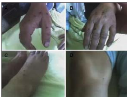
Figure 2. Smaller and mostly maculopapules lesions located on the hands (A, B) and the feet (C) (Case 2). Few lesions are seen on the right leg (D)

transient ischemic attack. An anticoagulant treatment was begun with 2.5 mg warfarin once a day. After 3 days, he was re-admitted with development of skin lesions, which were painless, papular and vesicular or bullous, 2 to 25 mm in diameter, dark purple in color, and involving specifically upper and lower limbs distal to the ankle and knee joints (Fig. 1). Gross hematuria also occurred on the 4th day of hospitalization due to coagulopathy. Second case was a 51-year-old woman with rheumatic heart disease, which was treated with mitral commissurotomy 8 years ago. She complained on numbness on both arms for one hour. Warfarin 5 mg once a day was administered together with enoxaparine. On the 4th day, small dark purple lesions appeared mainly on the skin of hands and feet (Fig. 2). Pathological examination of the lesions has shown capillary dilatation with mild perivascular lymphocytic infiltration and subcorneal hematoma. There was spontaneous and substantial healing of the skin lesions during the next few days in both cases. We suggested "atypical warfarin induced skin necrosis" for the definition of the lesions. However, we are not sure that these lesions might be a precursor of typical warfarin induced skin necrosis. The treatment of these benign acral cutaneous lesions might be discontinuation of warfarin treatment and initiation of heparin.