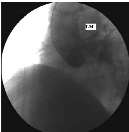
Figure 1. Aortography view of left main artery as a single coronary ostium