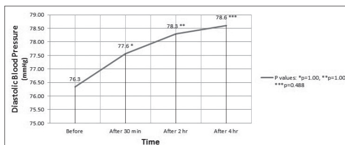
Figure 2. Diastolic blood pressure (mean) of the participants during the test. Analysis by repeated measures ANOVA