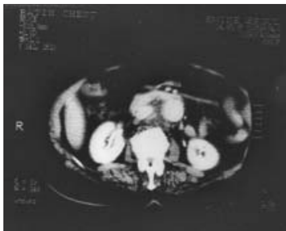
Figure 1. All patients were definitively shown not to have a concomitant thoracic aortic dissection

There was no post-operative mortality in our series. One patient had to be reoperated because of bleeding during early postoperative period. One patient required transient dialysis at early postoperative period because of transient rise of serum creatinine level. Fortunately, the increase did not sustain more