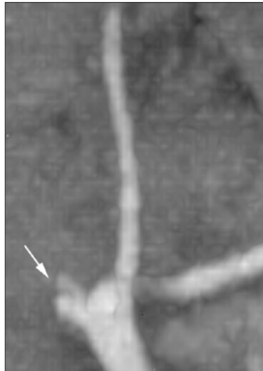
Figure 1. Coronal MIP reconstructed image shows the vessel cutoff sign (arrow) at the origin of the common hepatic artery

Emergent aortogram revealed brisk extravasations from the CHA origin (Fig. 2). The CHA was selected, and the guide wire passed into an extra vascular space. A 8mm Amplatzter Vascular Plug II (St. Jude Medical, St. Paul, MN) was positioned in the CHA as well as celiac artery origin (Fig. 3). Post embolization aortogram shows cessation of the bleeding (Fig. 4). His volume and pressor requirements dropped almost