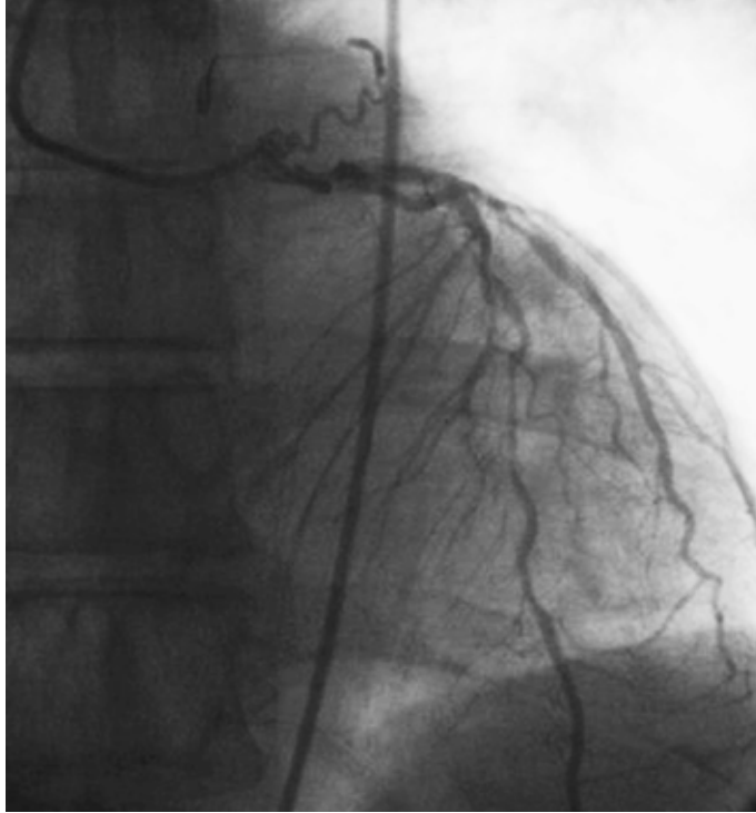
Şekil 1. Yaygın koroner arter hastalığına eşlik eden sol ana koroner arterden köken alıp pulmoner artere dökülen fistül izlenmektedir

anjyografisinde sol ana koroner arterde, sol ön inen arterde, sirkumfleks arterde ve sağ koroner arterde kritik lezyonları mevcuttu (Şekil 1, 2, Video 1-4. Video/hareketli görüntüler www.anakarder.com ' da izlenebilir). Ayrıca sol ana koroner arterden köken alıp pulmoner artere dökülen fistül tespit edildi (Şekil 1, 2, Video 1-4. Video/hareketli görüntüler www.anakarder.com ' da izlenebilir). Hastaya koroner arter baypas cerrahisi ve fistül ligasyonu önerildi.