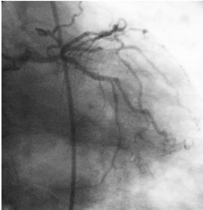
Şekil 2. Fistülün sol ana koroner arterden köken aldığı izlenmektedir