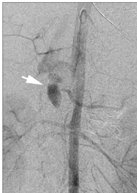
Figure 2. Emergent aortogram revealed brisk extravasation (arrow) from the common hepatic artery origin