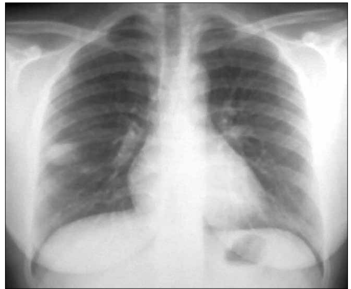
Figure 3. Control chest X-ray